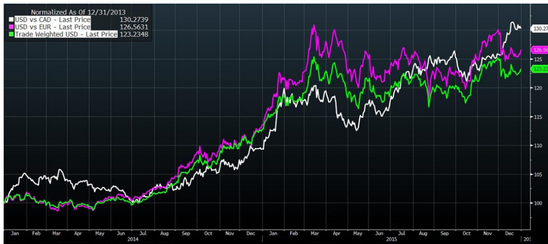
Devaluation of Currencies vs. USD

There were three major foreign exchange shocks that took place in 2015. The first one took place in January when the Swiss National Bank (SNB) abandoned the floor set for the Swiss franc's exchange rate against the Euro and as a consequence, the Swiss franc appreciated as much as 23%. Switzerland has 60% of their trade with the eurozone and that is where they need currency weakness. The Swiss economy is now in deflation. The second shock took place in August when China devalued the renminbi. There was a global impact as fear of weak demand and oversupply in commodities resulted in a further drop in commodity prices. This action by China appears to have spurred exporters of basic resources to devalue their currencies in order to remain competitive and retain revenue. Canada is an example of this with a 16% depreciation in the Canadian dollar against the U.S. dollar in 2015. The final shock came in December when the ECB did not deliver to the extent of market expectations and this drove the Euro up 4.5%. During the last recession, we experienced currency wars and a variety of countries racing to devalue their currency; a replay of which may take place.